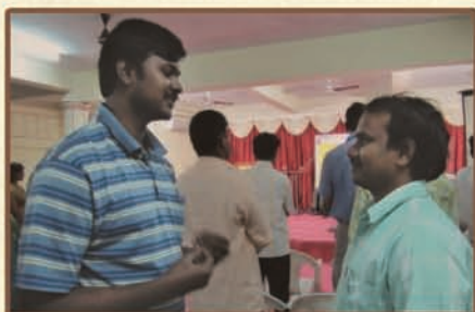
Indians practicing the One-Minute Witness faith-sharing tool