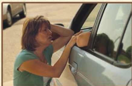
Gas Buy-Down faith-sharing event