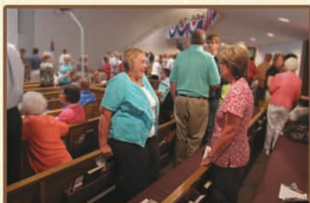
Americans practicing the One-Minute Witness faith-sharing tool