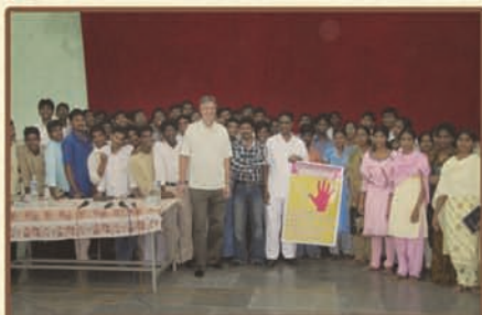
Seven-day faith-sharing challenge