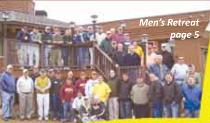
Men's Retreat page 5