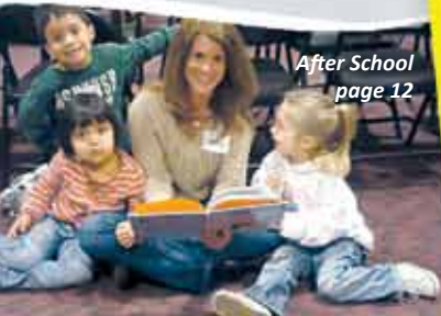
After School page 12

"How does God's love abide in anyone who has the world's goods and sees a brother or sister in need and yet refuses help? Little children, let us love, not in word or speech, but in truth and action" (I John 3:17-18).