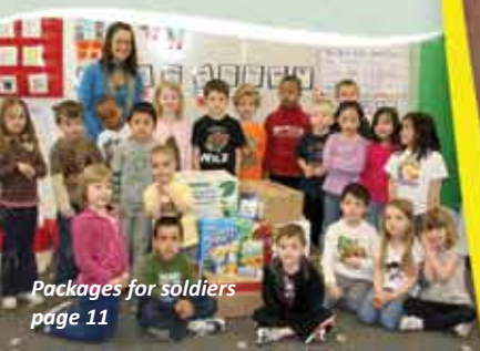
Packages for soldiers page 11