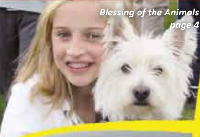
Blessing of the Animals page 4