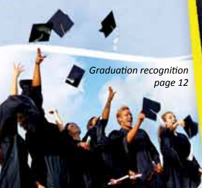
Graduation recognition page 12