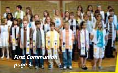
First Communion page 3