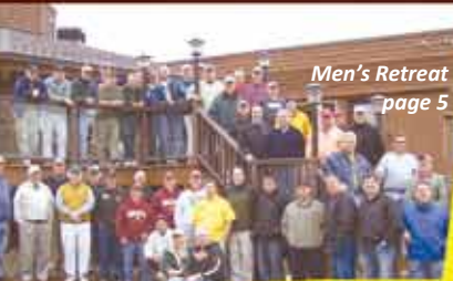
Men's Retreat page 5