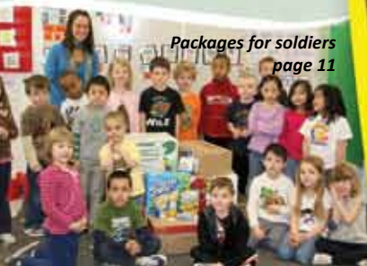
Packages for soldiers page 11