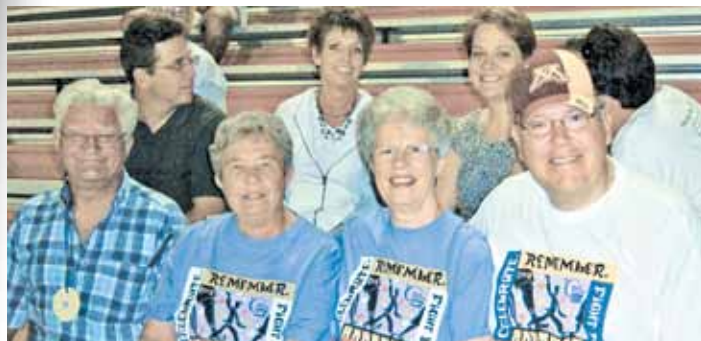
Some of the many Lord of Life participants from last year's Relay for Life event.