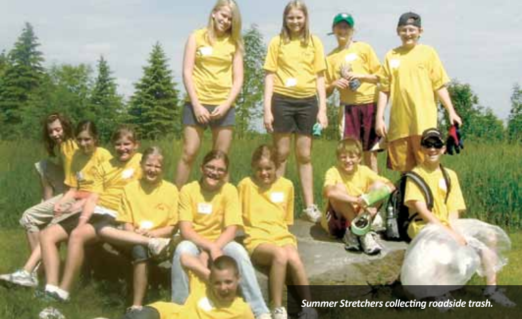
Summer Stretchers collecting roadside trash.